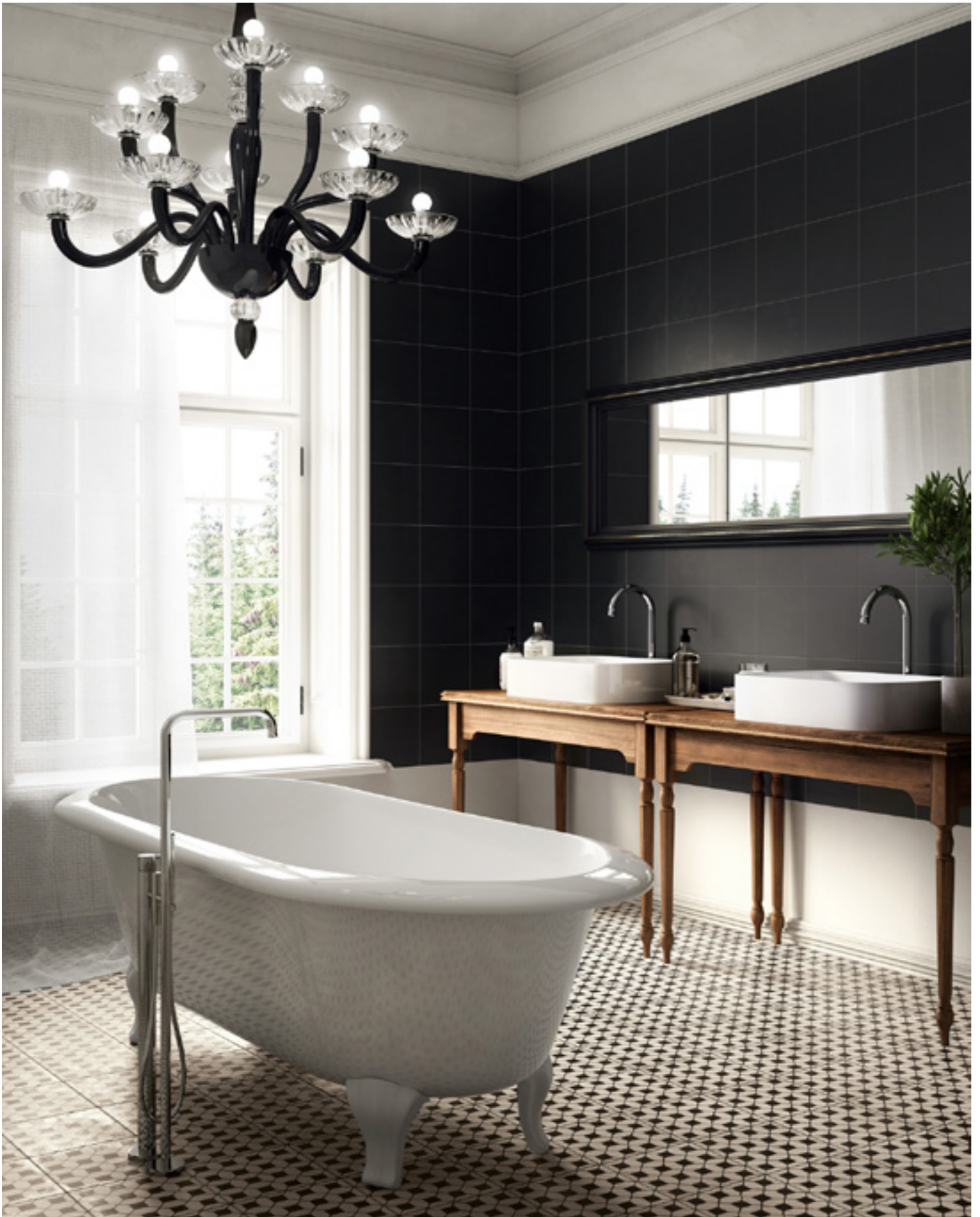
WALL - VULCANO (Black) FLOOR - Decor 1