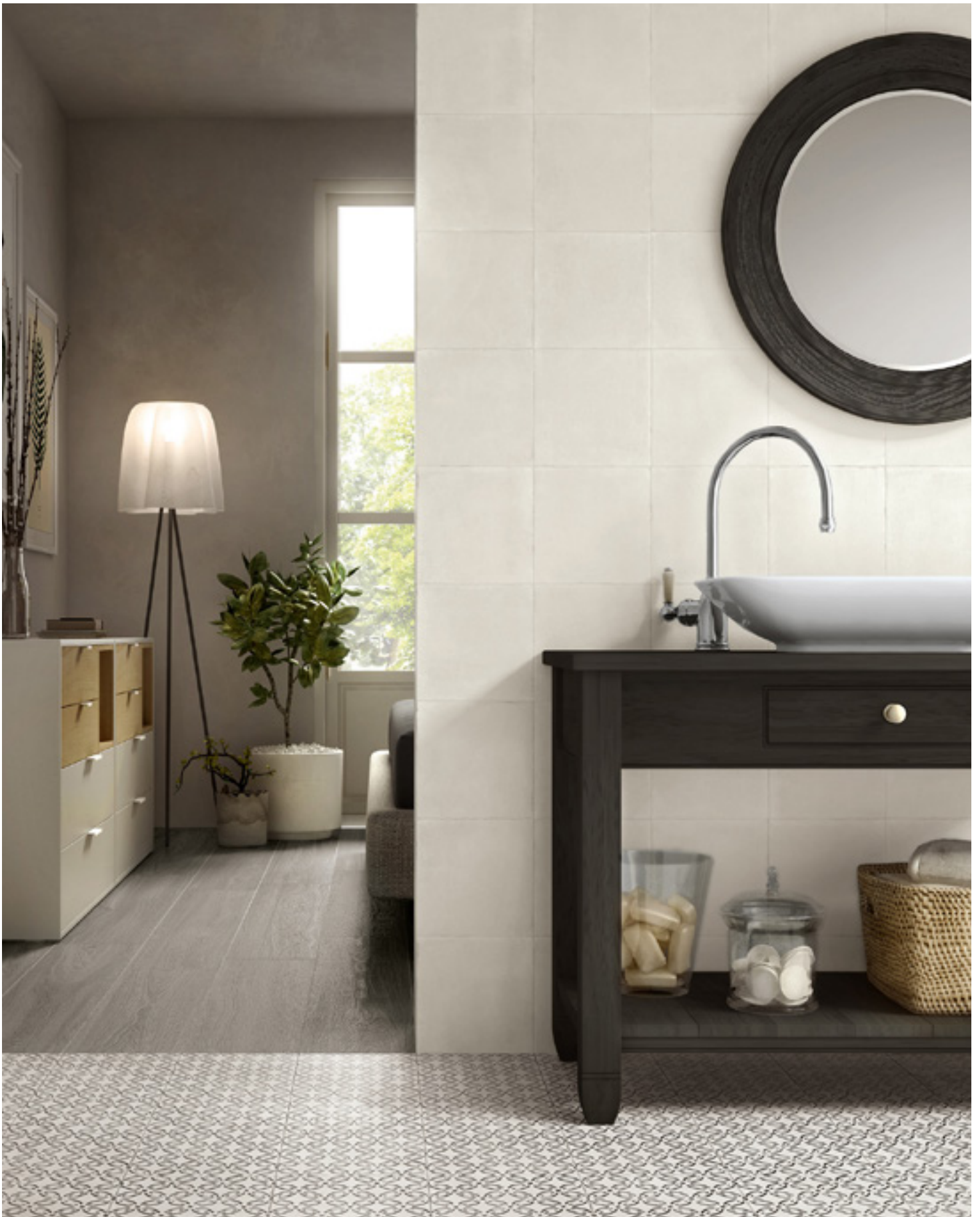
WALL - BIANCO ANTICO (White) FLOOR - Decor 2